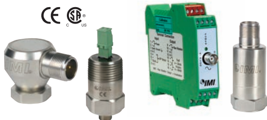
Continuous Vibration Monitoring Equipment

These products are backed up with IMI Sensors' industry leading Lifetime Warranty+, and Best Price Guarantee. IMI has 24-hour customer service, and our promise of Total Customer Satisfaction.