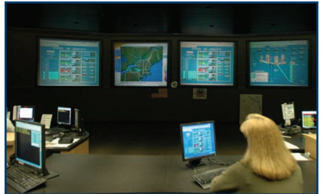
Vibration levels are monitored at the control room