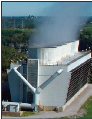
Vibration transmitters monitor cooling towers

Displacement is the preferred measure for low frequency and balance measurements. It is often difficult to make good acceleration and even velocity measurements below 10 Hz (600 cpm). The 653A01 measures accurately down to 1.5 Hz (90 cpm) making it a very effective sensor for monitoring slow speed machinery. Since it is housed in a hermetically sealed stainless housing, it is an excellent choice for use in harsh and corrosive environments like cooling towers. The unit has a range of 40 mils p-p and a frequency range of 1.5 to 300 Hz (90 to 18,000 cpm). It is a 2-wire, loop-powered device and is fully compatible with most plant monitoring systems.