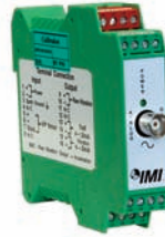
Model 682B05 (US Patent Number 6,889,553)