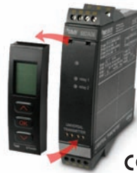
Model 682A06 & Model 682A16 (shown with optional programmable display Model 070A80)